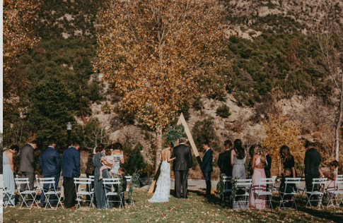
South Main Town Square